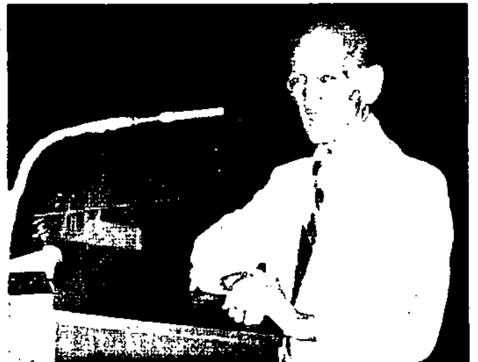
Major Donald E. Keyhoe