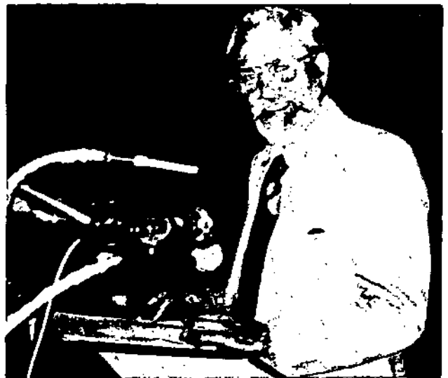
Dr. J. Allen Hynek